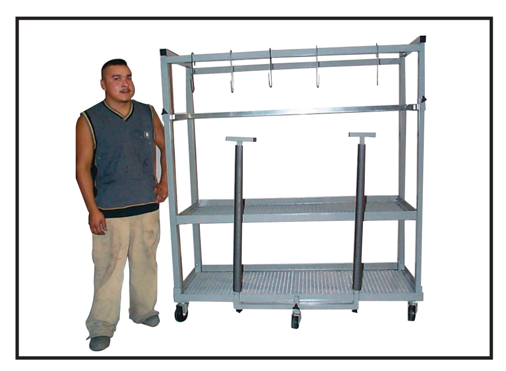
• Finished and ready to go.