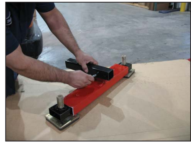
The adapter attaches to the cross beam adapter with the supplied bolt.