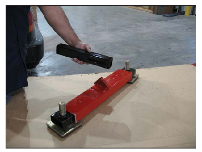
The jack beam adapter has a slot one side.