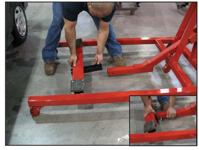
Slide the assembled adapter into the lift beam of the lift. Lock it into place with the supplied locking pin.